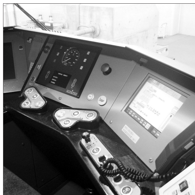
Trip computer: inside the cab of a suburban ATO train