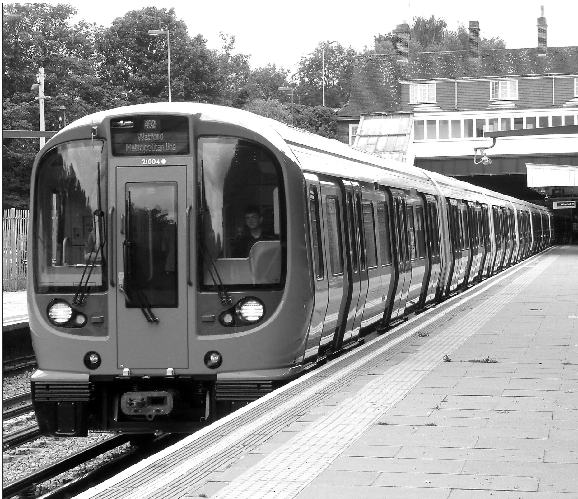
Taking stock: the new trains are capable of driving themselves nearly independently and have air conditioning as well as computers that tell depots when parts need replacing