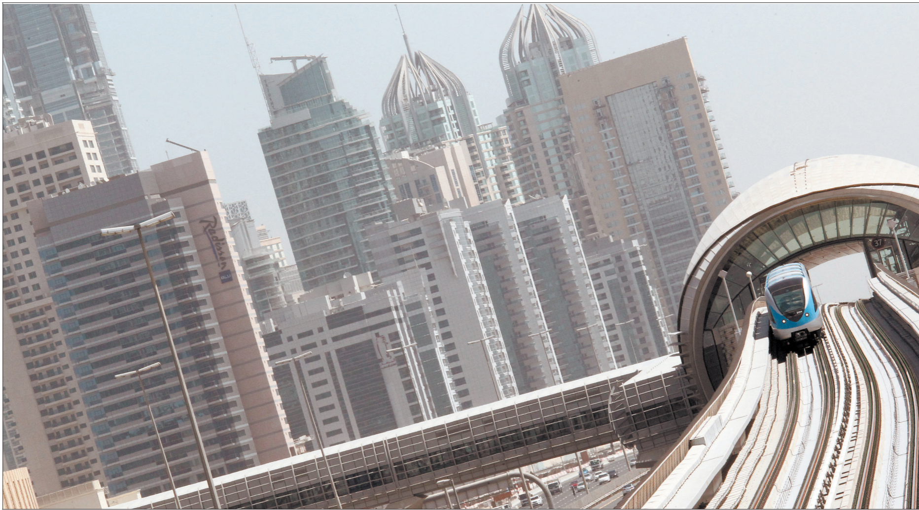
On the right track: the Dubai metro speeds by the Sheikh Zayed road. The metro has outperformed its pre-opening traffic forecasts, despite the regional popularity of the car

It is the kind of scene likely to be increasingly replicated across the Middle East, as the region's economies, buoyed by high oil