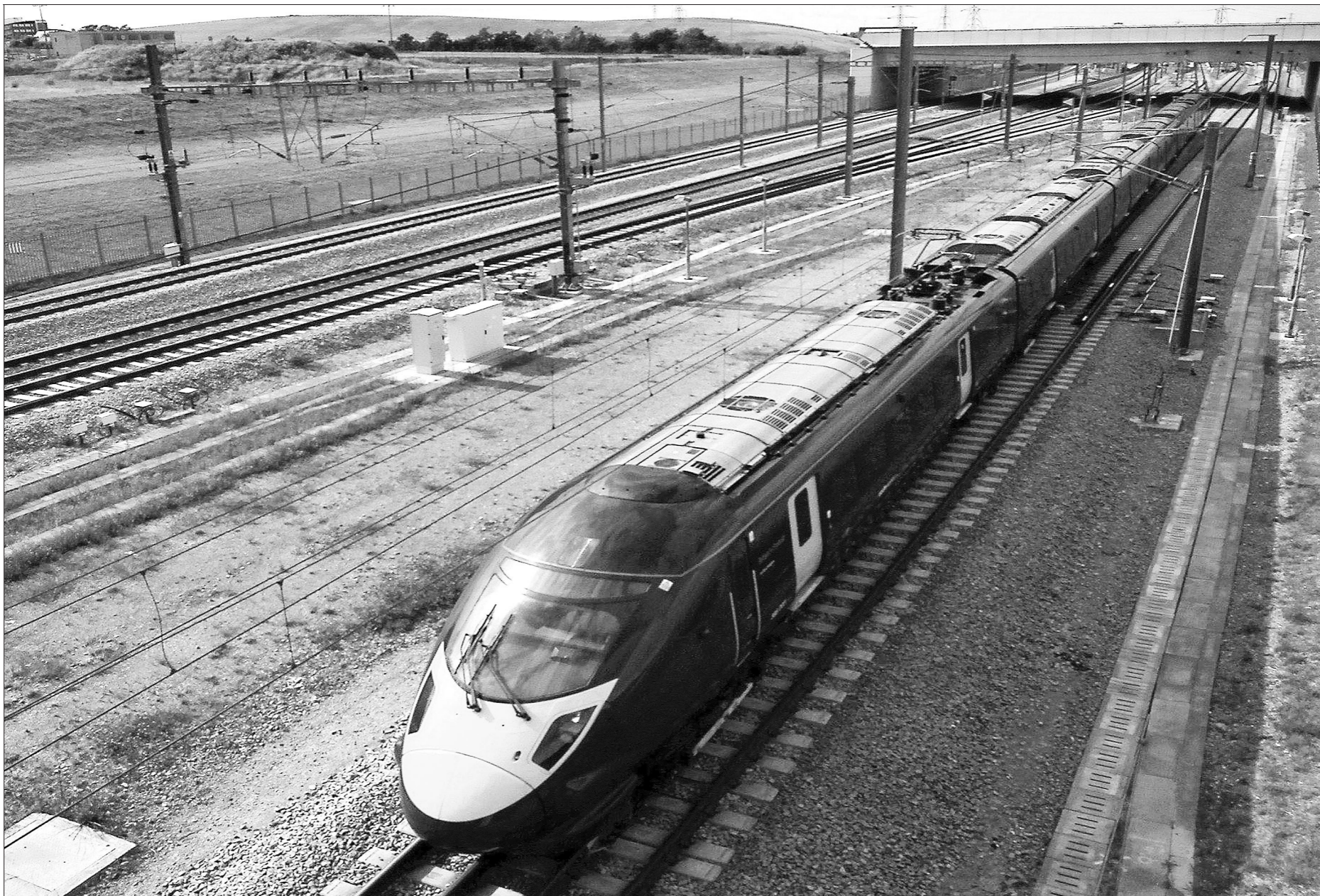
On target: Hitachi's 140mph Class 395 Javelin train can travel from Ashford, Kent, to London St Pancras in 37 minutes

Unife accepts the right of Chinese suppliers, which have yet to supply any trains to European Union markets, and companies from Korea, whose Hyundai Rotem has supplied the Athens metro and Irish rail-