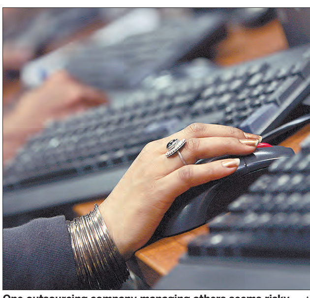
One outsourcing company managing others seems risky

However, this has begun to change, he says. "In the past 18 months, most banks have figured out that this continued state of uncertainty is the 'new normal' and that, even when there's uncertainty in the external environment, they still need front-office projects that ensure that they all stick to