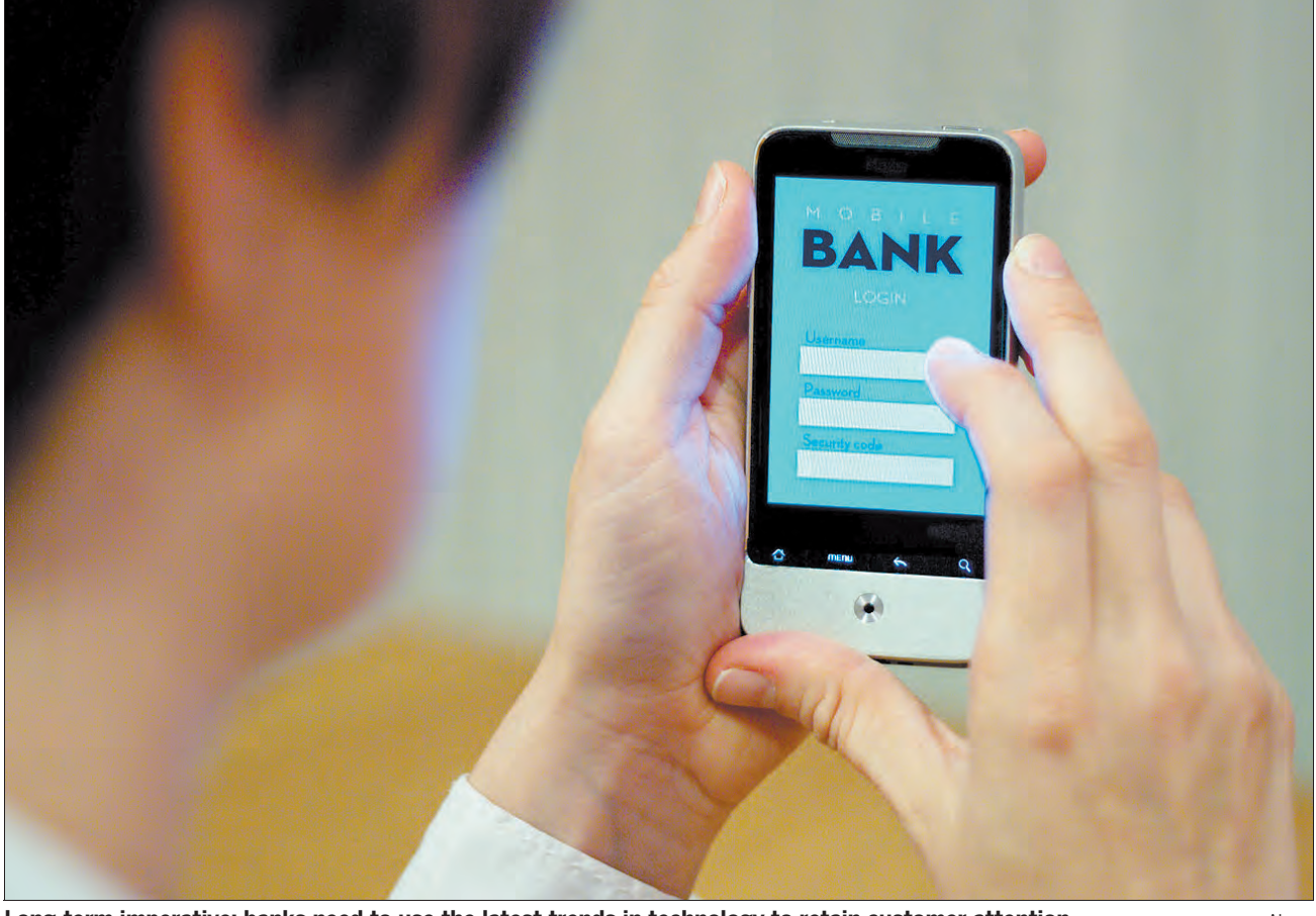
Long-term imperative: banks need to use the latest trends in technology to retain customer attention

"Technology not only drives services firms to investments in their change and innovation but also helps