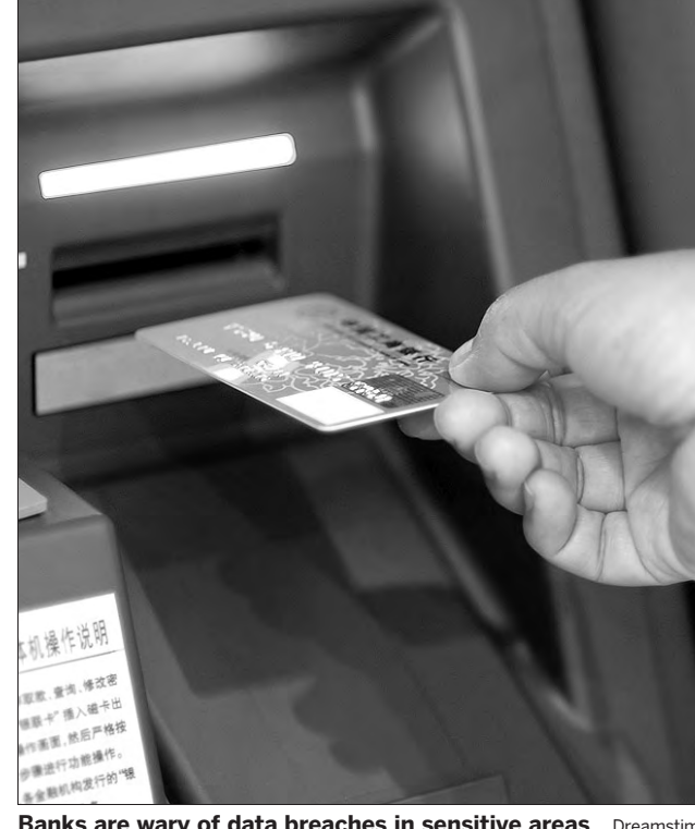
Banks are wary of data breaches in sensitive areas

Atlanta-based SunTrust, are the physical hardware. For processing of customer data using the Varolii pay-as- example, 80 per cent usage outside national borders. you-go cloud-based voice of a server's capacity